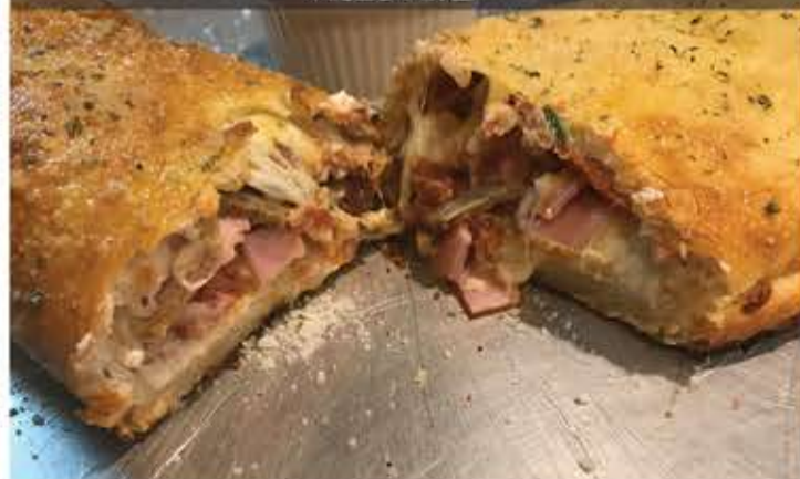
MEAT LOVERS STROMBOLI