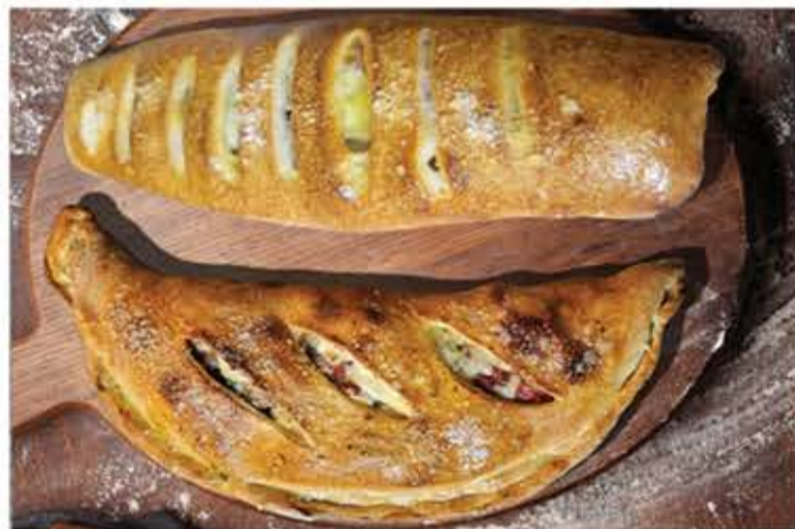
DELICIOUS CHEESY TASTY