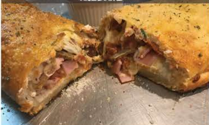
MEAT LOVERS STROMBOLI